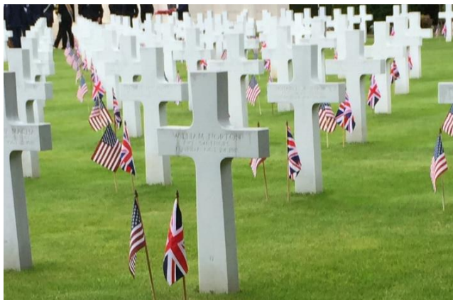
Flags placed by the memorials

those of members of the Eagle Squadron from WWII, who are buried in the RAF plot, and the founder of the Squadrons Charles Sweeney in plot 119 in the civilian cemetery.