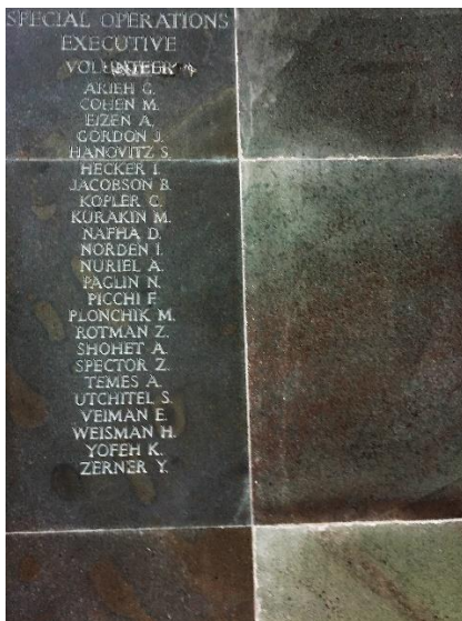
The new inscriptions on the Memorial