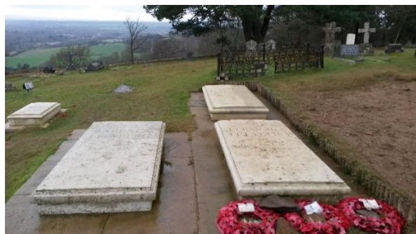
The Freyberg family graves

In the churchyard of the tiny St Martha's in Guildford lie 3 graves belonging to the Freyberg family. The beautiful setting, at the top of St Martha's Hill, with picturesque view of the woods and fields of Surrey below, lend a sort of appropriate grandeur, particularly to one of the graves, that of Lieutenant General Bernard Cyril Freyberg, 1st Baron Freyberg, VC, GCMG, KCB, KBE, DSO & Three Bars (21 March 1889 – 4 July 1963) who was a British-born soldier and Victoria Cross recipient, and served as the 7th Governor – General of New Zealand from 1946 – 1952.