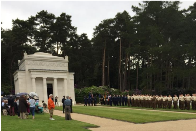
At the American Chapel, at the beginning of the ceremony.

The annual Memorial Day Service this year at Brookwood American Military Cemetery coincided with the 100 th Anniversary of the entry of the USA into WWI. American and British flags had been placed on each individual serviceman's grave, including