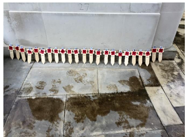
Crosses at the bottom of Panel 27

For further information see: jewishnews.timesofirael.com Guildford Dragon NEWS